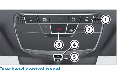
Overhead control panel