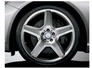
Optional 20" AMG 5-spoke (Sport Package Plus One)