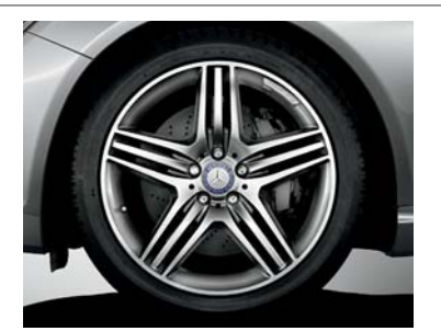
Optional 19" AMG triple 5-spoke (Sport Package)