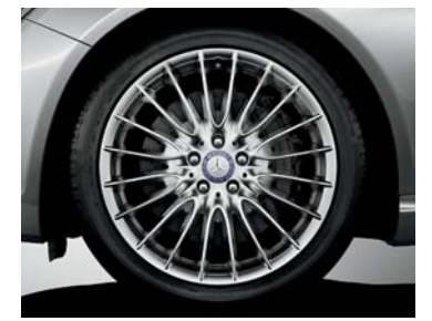
Standard 19" multispoke (CL 600; also optional on CL 550 4MATIC)