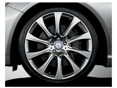
Optional 20" 10-spoke