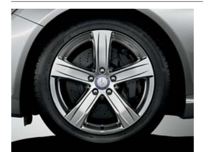
Standard 18" 5-spoke (CL 550 4MATIC)