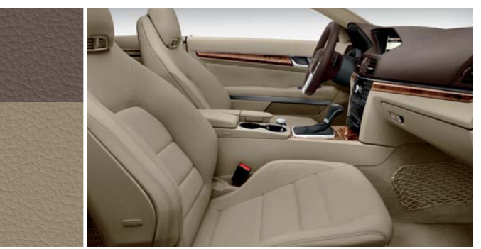
Almond Beige/Mocha Brown (with Burl Walnut wood)