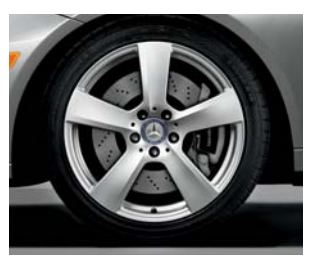
Standard 18" 5-spoke (E 550)