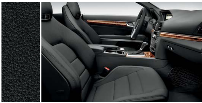
Black (with Burl Walnut wood)