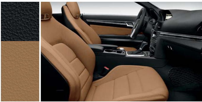
Natural Beige/Black (with Black Ash wood)