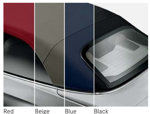
Beige Blue Black