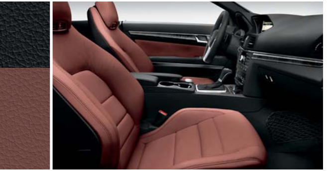
Red/Black (with Black Ash wood)