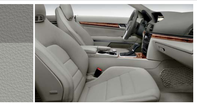
Ash/Dark Grey (with Burl Walnut wood)