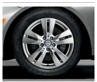
Standard 17" split 5-spoke (E350)