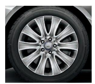
18" 10-spoke<sup>2</sup> (standard on S 550)