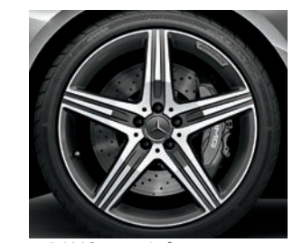
20" AMG 5-spoke<sup>2</sup> (standard on S 63 AMG 4MATIC)