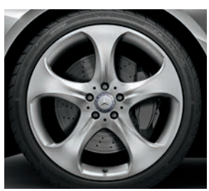
20" 5-spoke<sup>2</sup> (optional on S 550)