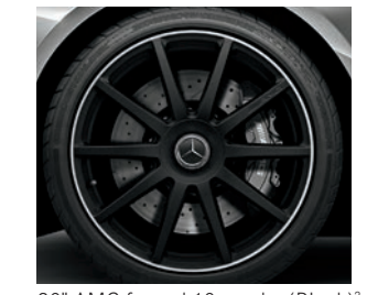
20" AMG forged 10-spoke (Black)<sup>2</sup> (optional on S 63 AMG 4MATIC)