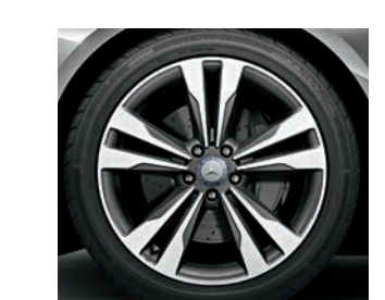
19" twin 5-spoke<sup>2</sup>