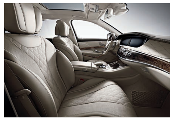
Optional on S 550 (shown) and S 63 AMG 4MATIC