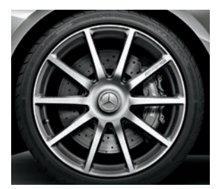
20" AMG forged 10-spoke (Silver)<sup>2</sup> (optional on $63 AMG 4MATIC)