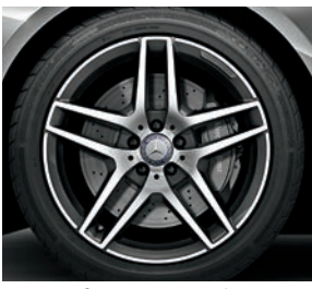
19" AMG<sup>®</sup> twin 5-spoke<sup>2</sup> (S 550 Sport Package)