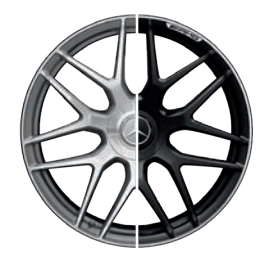
21" AMG multispoke 21" AMG forged cross-spoke silver or black O GLC 63 S Coupe