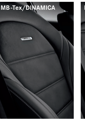
AMG GLC 43 O GLC300 shown AMG GLC 63 O GLC350e O AMG GLC 43