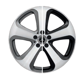
19" 5-spoke silver w/black accents ● GLC 300 Cpe OGLC 300 SUV O GLC 300 SUV O GLC 350e O GLC 350e