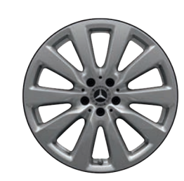
19" 10-spoke O GLC 300 O GLC 350e