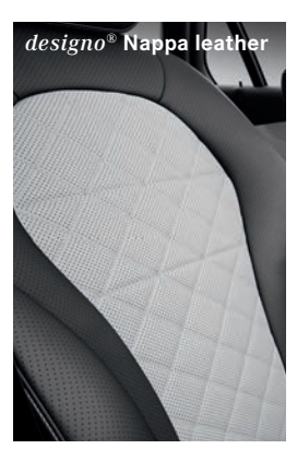
O All models