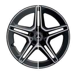
19" AMG® twin 5-spoke silver w/black accents O GLC 300 SUV O GLC 300 SUV AMG Line Night Pkg