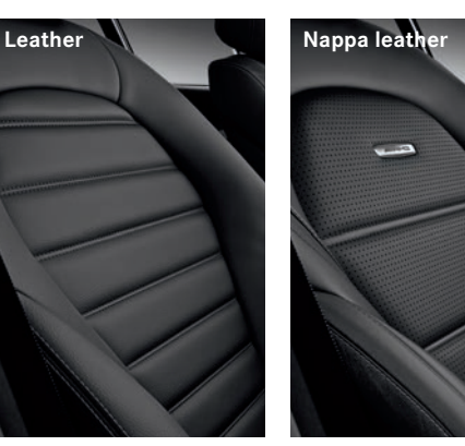
AMG GLC 63 S O AMG GLC 63