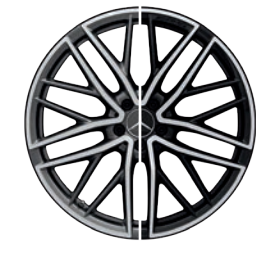
21" AMG split 10-spoke silver or w/black accents O GLC 43