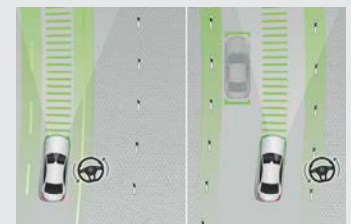
Active Steering Assist