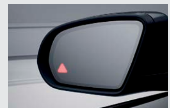
Active Blind Spot Assist