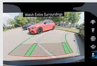
Surround View System