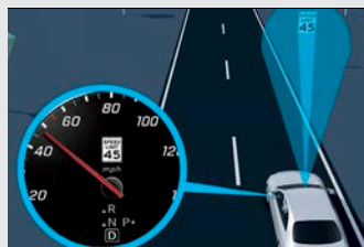
Active Speed Limit Assist

It wouldn't be a legendary Mercedes-Benz without legendary safety.