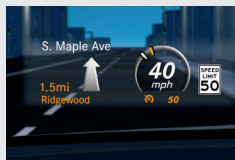
Active Speed Limit Assist †

One reason Mercedes-Benz is a legendary brand is because of legendary safety.