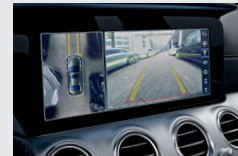
Surround View System †