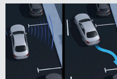
Active Parking Assist †