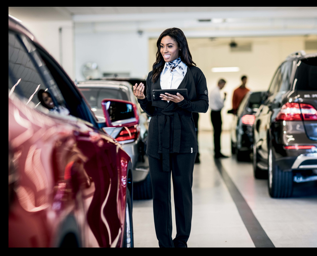
Great protection continues.

Mercedes-Benz Certified Pre-Owned Extended Limited Warranty