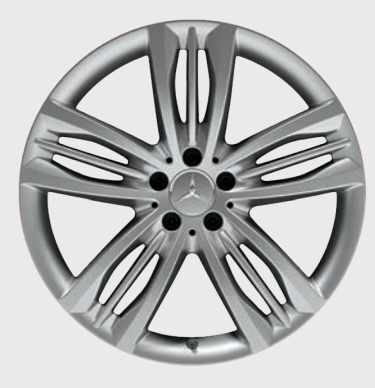
20" triple 5-spoke △ S 560, S 650