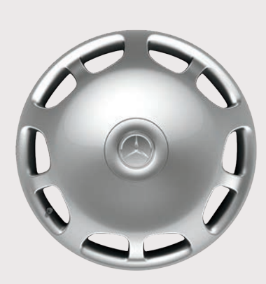
20" Maybach Exclusive forged o S 560, S 650