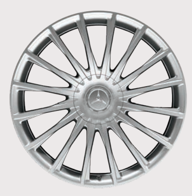
20" forged multispoke o S560, S650