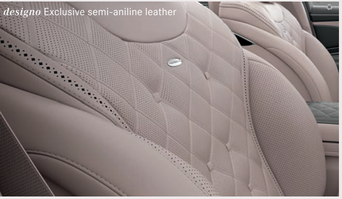
o All models