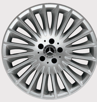
△ S 560, S 650