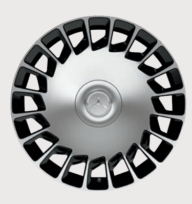
20" Maybach Exclusive forged o S 560, S 650