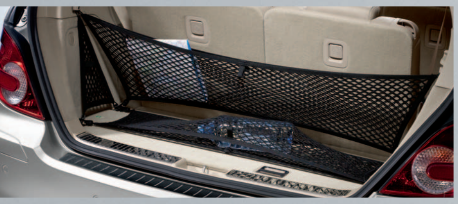
Cargo Nets, Floor, Loading Sill/Rear

Versatile and convenient, strong and durable nylon nets help you to secure objects in the back of your R-Class Vehicle. Rear net may be attached to the loading sill. Each net is sold separately.