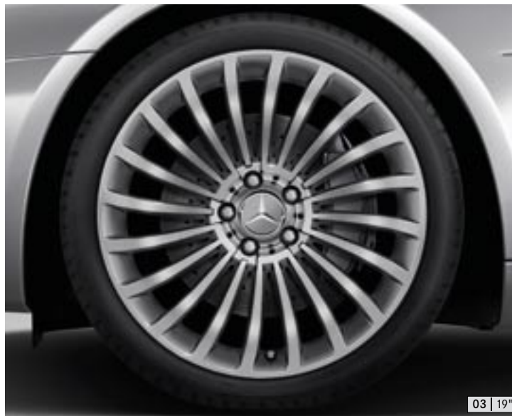
03 | 19"