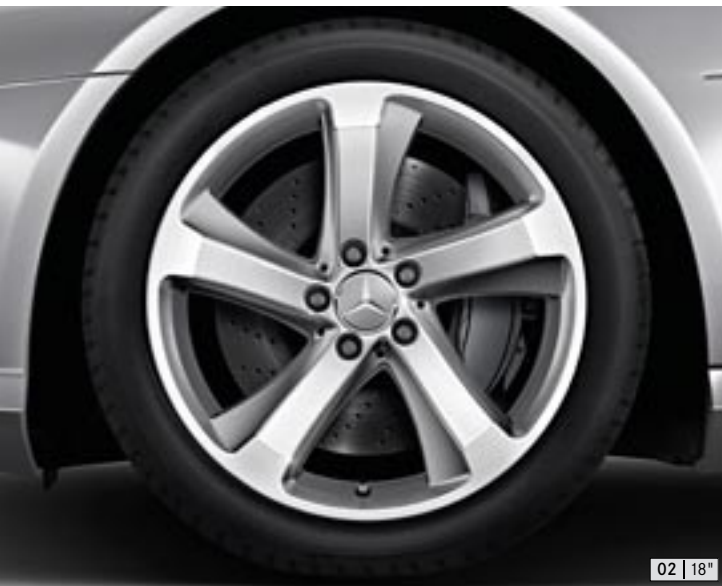
02 | 18"