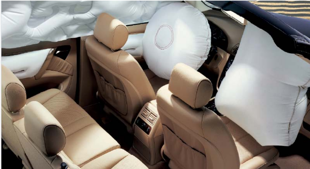
Demonstration of available airbags in the M-Class (W 163). The accident-specific circumstances determine which airbag(s), if any, will deploy.

On vehicles equipped with OCS, deactivation of the passenger front air bag can occur as a result of various factors, such as an empty seat or an occupant who does not meet a certain minimum weight, or foreign objects interfering with the system.