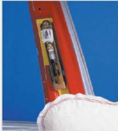
Seat belt height adjustment