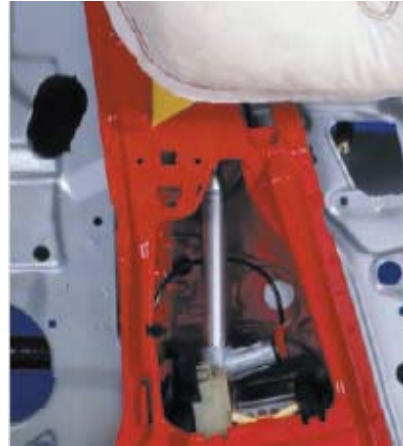
ETD in installation position

If the seat belt is also equipped with a seat belt force limiter, the limiter, when activated, helps to reduce the peak force exerted by the seat belt on the occupant. The seat belt force limiter is also designed to work with a deploying front air bag by providing more even distribution of occupant restraining forces between the seat belt and air bag.